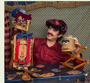
July 9 at 10am: That Puppet Guy