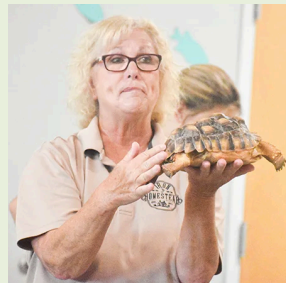
June 25 at 2pm: Georgia Untamed Zoo