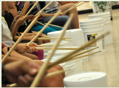
June 16 at 3pm: Grassroots Drumming