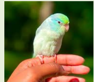
July 16 at 2pm: Enchanted Zoo

Please note: All children must be accompanied by a parent or caregiver while in the library.